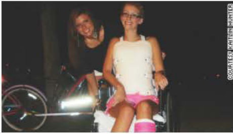
Hunter spent a month in the hospital after the car accident, and doctors put her on antibiotics to prevent an infection.

The result ended Hunter's struggle with C. diff.