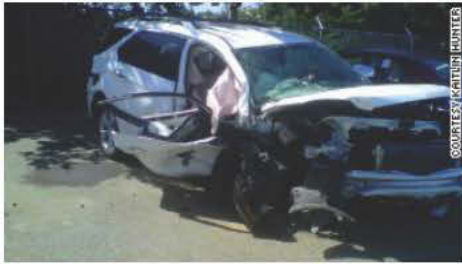
A near-fatal car accident left Hunter with a fractured spine, lacerated liver and colon, and 10 broken toes.

But "right when I got off the plane, I went to the hospital. I was having extremely bad stomach pain. A month later, we found out it was C. diff," Hunter said, using the abbreviation for the bacteria clostridium difficile.